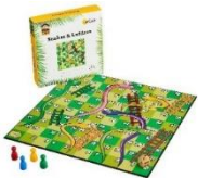
Snakes & Ladders Game

Term 4 2020 Tree Top Savers Rewards - rewards are now available to order