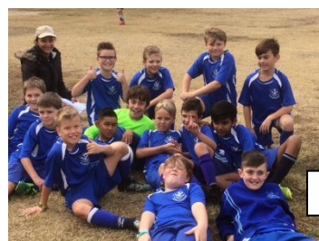
Yr 5 Boys