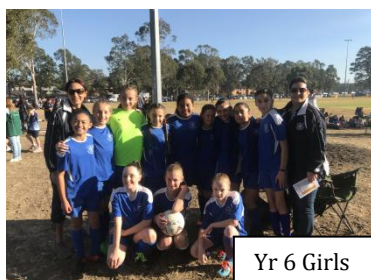
Yr 6 Girls