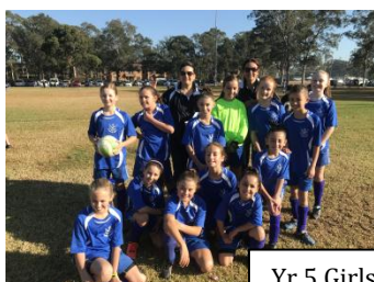
Yr 5 Girls