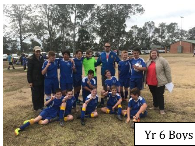
Yr 6 Boys