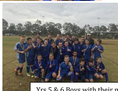
Yrs 5 & 6 Boys with their medals