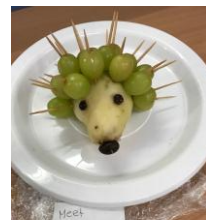
Charlise M – 6B