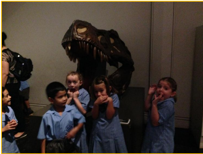
Last Monday Year 1 students visited the Sydney Museum.