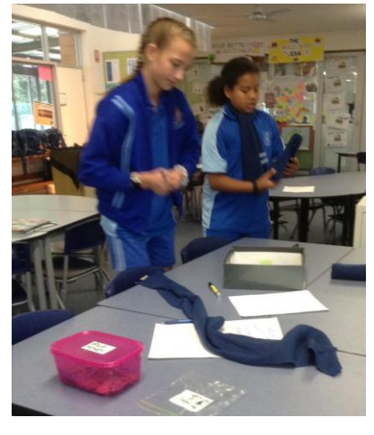
The group of year 5&6 students making scarves last week in which they sold for $3.00 to support the San Miguel Family Centre.